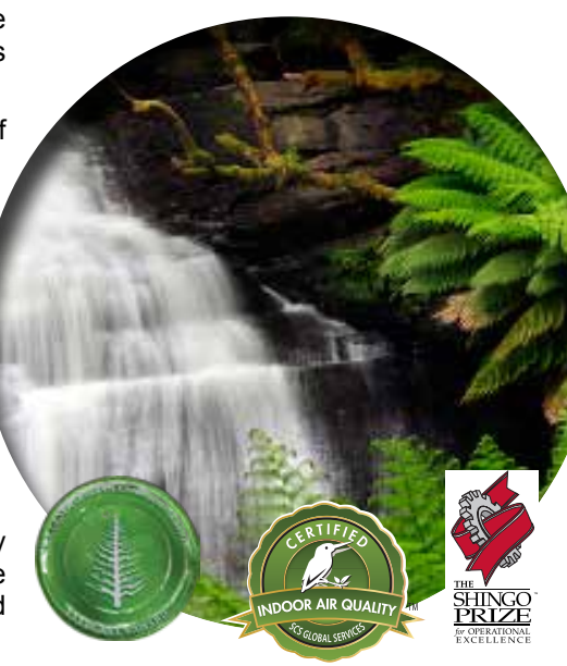
INDOOR ADVANTAGE GOLD FURNITURE

By improving routine maintenance procedures in the wash system of our paint line and experimenting with low temperature chemistry, and we have reduced our consumption of natural gas by 12-15%. Our goal is to achieve an additional 10% reduction in the coming year.